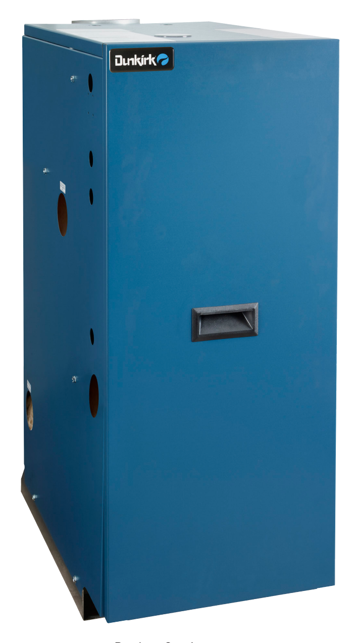
Dry Leg Casting