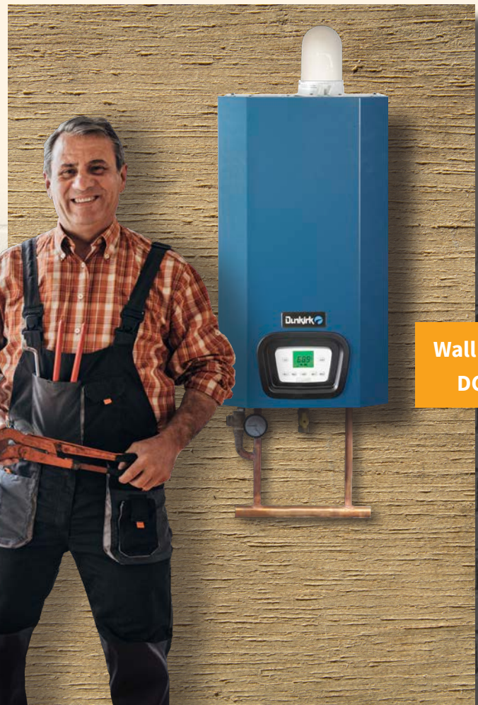
Wall Mounted DCC/DCB