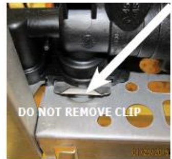
RIGHT SIDE CLIP - INSIDE BOILER JACKET