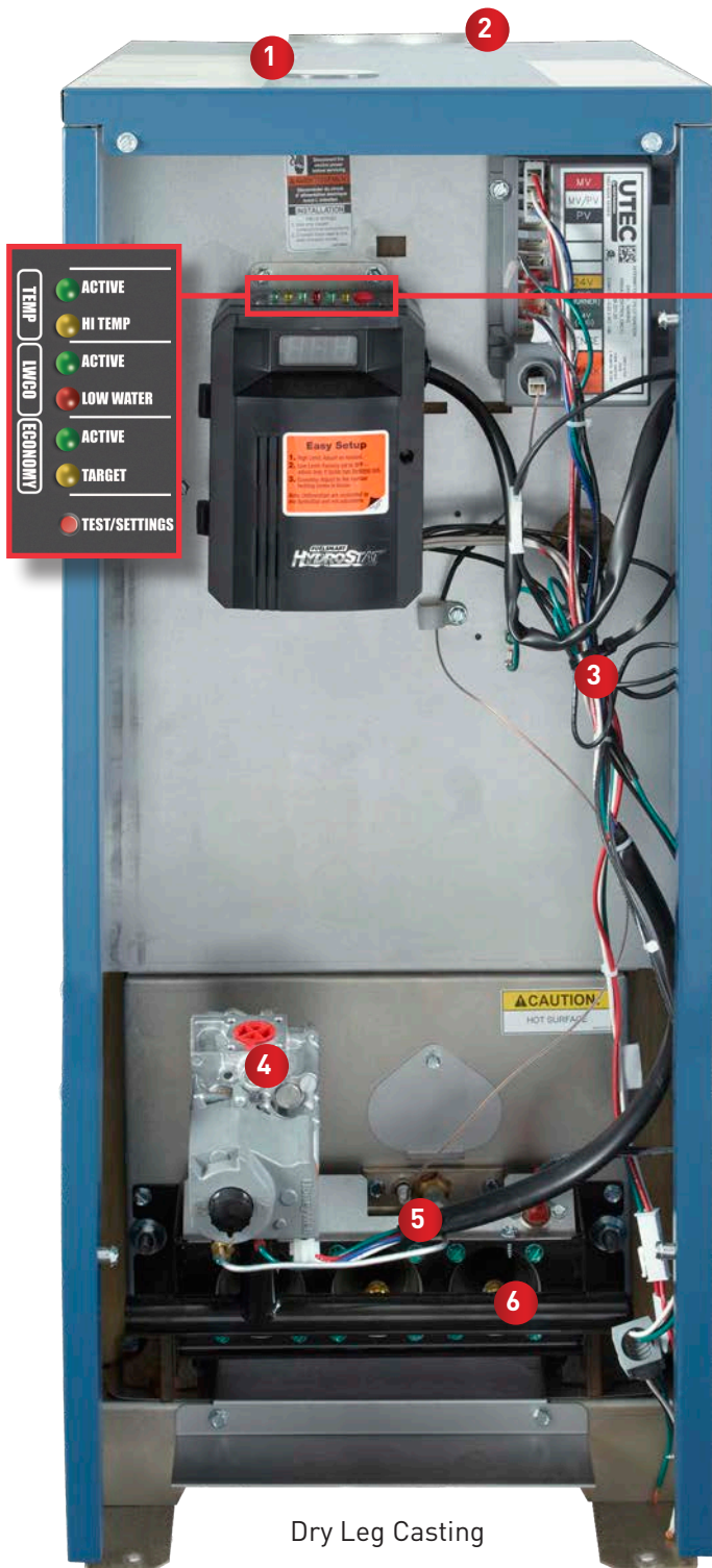
Dry Leg Casting