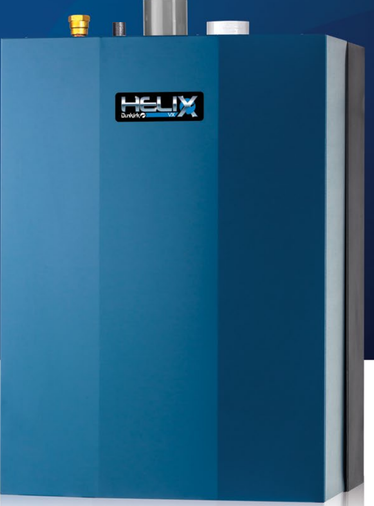
*Unit must be registered within 60 days from the date of original installation. All terms of Trinity Extended Service Agreement apply.